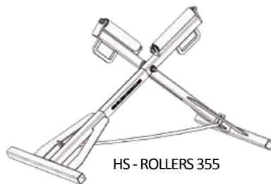
HS - ROLLERS 355

Working range max: \varnothing 355 mm (14" IPS) Overall dimension (W x D x H): 1421 x 600 x 818 mm 55.9" x 23.6" x 32.2" Weight: 33 Kg 72.8 lb Weight capacity: 1000 Kg 2.200 lb