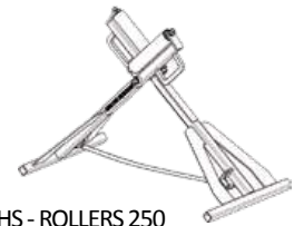
HS - ROLLERS 250

Working range max: \varnothing 250 mm (8" DIPS) Overall dimension (W x D x H): 1150 x 500 x 756 mm 45.3" x 19.7" x 29.7" Weight: 26 Kg 57.3 lb Weight capacity: 500 Kg 1.100 lb